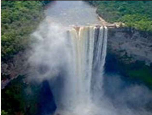
KAIETEUR FALLS: Standing at 825 feet, these falls are nearly five times taller than North America's Niagara Falls.

Culture: Guyanese culture is a vibrant tapestry woven from various influences, including Indian, African, Amerindian, British, Portuguese, Chinese, and Creole cultures. This diversity is reflected in the country's customs, traditions, festivals, and spiritual beliefs, making it one of the most culturally rich nations in the world. With over nine (9) Indigenous tribes and a blend of customs and celebrations, Guyana showcases a unique cultural identity that combines Caribbean elements with Indigenous roots.