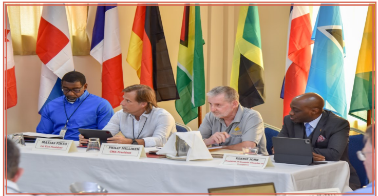
Head Table: Listening to a presentation

Here are pictorials of CMA 26th Annual General Meeting (AGM) held at the Radisson Grenada Beach Resort in the beautiful spice island of Grenada. Do enjoy!