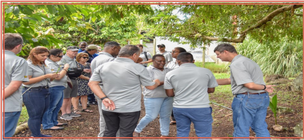
Group Tour: Spice & Herb Garden