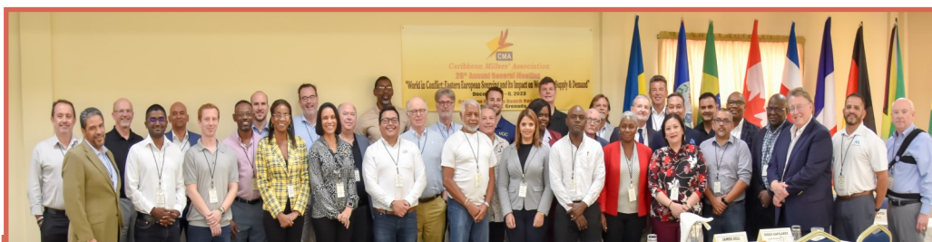
Delegates in attendance: 26th Annual General Meeting CMA December 2023 Grenada