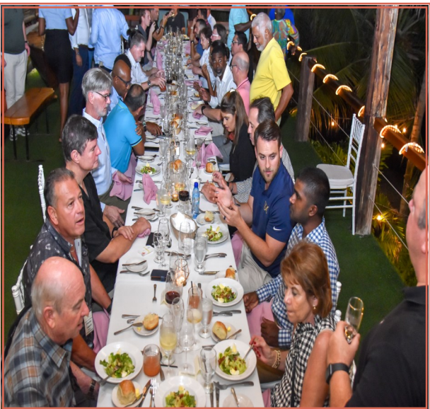
Dinner at the Aquarium Restaurant (rooftop)