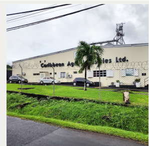
Caribbean Agro Industries

In this quarterly newsletter, we are pleased to highlight Caribbean Agro Industries Limited (CAI), located in the sub-urban community of Mt. Gay, which lies on the immediate outskirts of the city of St. George's on Grenada's west coast. A long-standing member of the Caribbean Millers' Association (CMA). We also have additional new features that we hope will be informative for you.