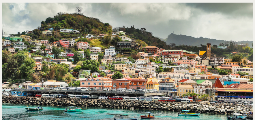
View of Grenada

We value your input on how we can improve our newsletter to be more engaging and informative. Let's explore Caribbean Agro Industries Ltd., the beautiful island of Grenada and other new features in this issue.